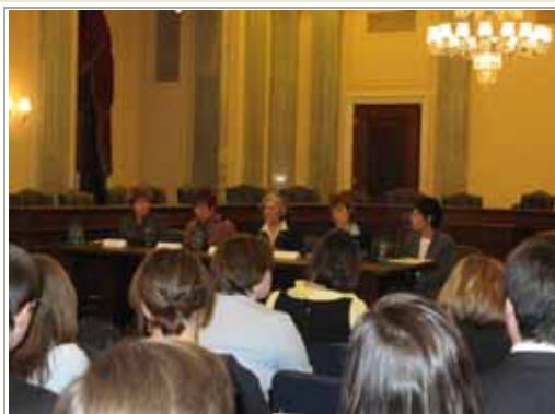
The panelists discuss the important work of each of the CDC Centers they represent.

Dr. Julie Gerberding, Director of the Centers for Disease Control and Prevention met with dozens of congressional staff and partners on Wednesday, February 27, during a briefing on the CDC's critical health protection efforts. The briefing was hosted by members of the Congressional Study Group on Public Health: Representatives Jim McGovern, Lucille Roybal-Allard and Kay Granger, in addition to Senators Daniel Inouye, Edward Kennedy and Congressman Jerry Lewis. Stay tuned for additional information from this briefing!