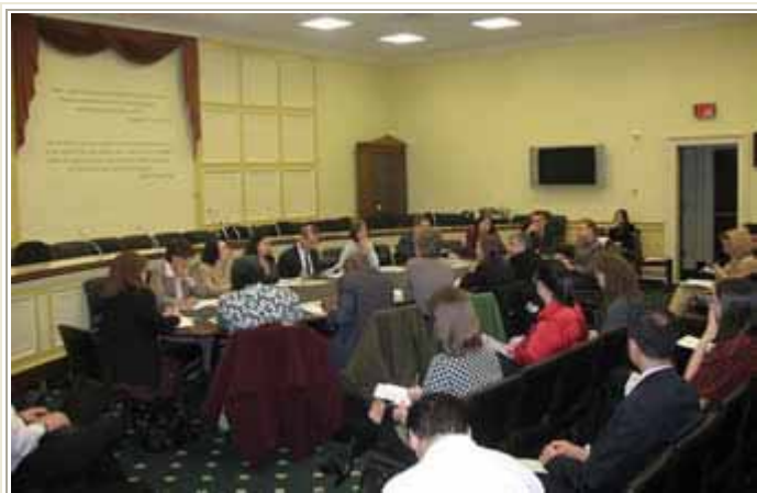
Photo from the November 12th Meeting