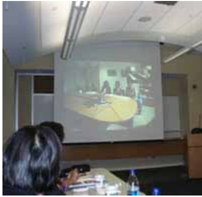
Video conference with CDC Staff in Kenya