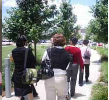
Staffers walking across the Chamblee Campus to the Insectary