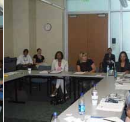
Occupational Safety and Workplace Health briefing